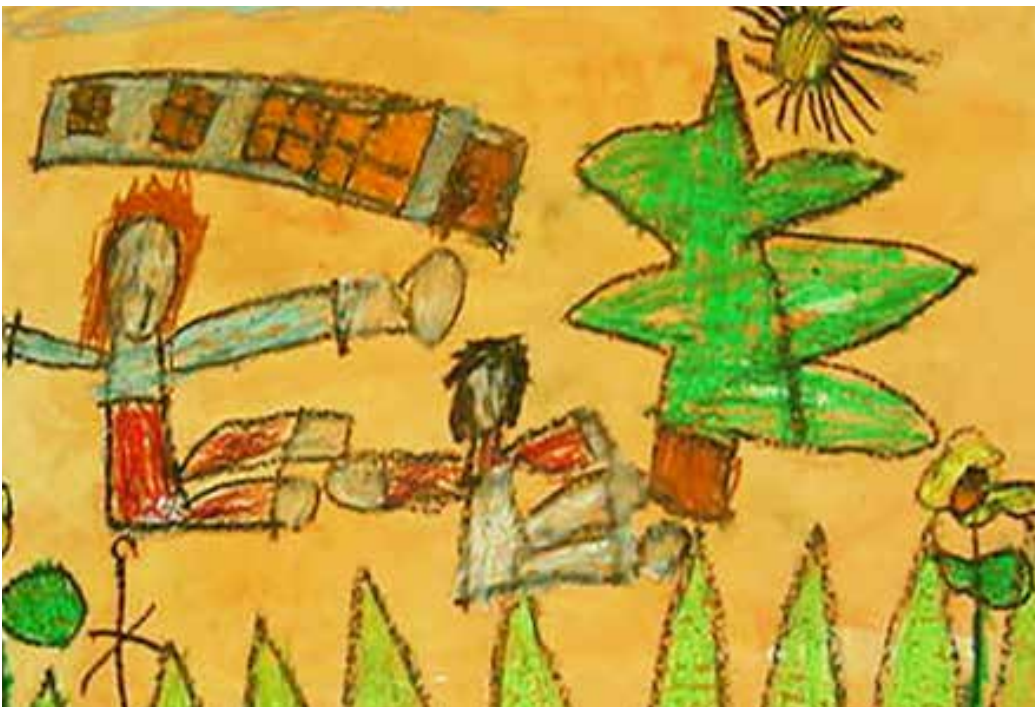
Warm color wash on family portrait.